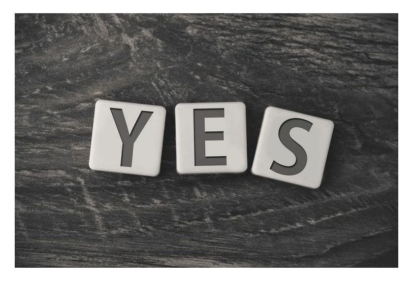
Type 'yes' in the chat if you agree