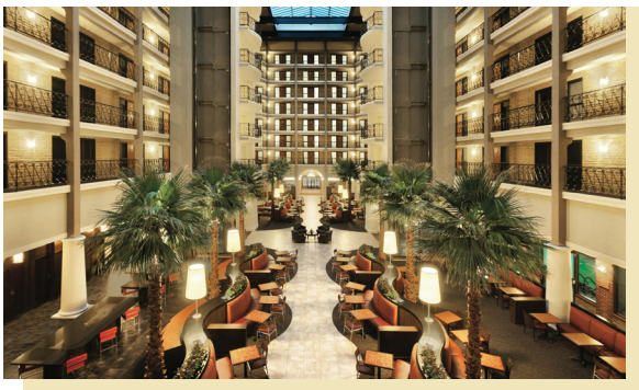
Hyatt Regency Green Bay