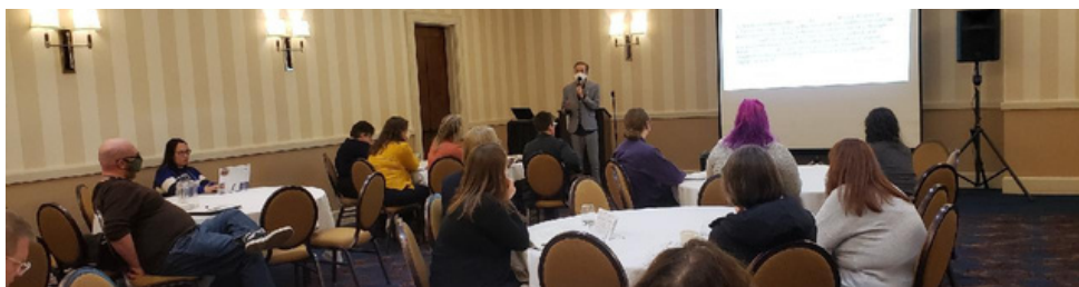
Wisconsin Association of Academic Librarians (WAAL) Conference, April 20 - 22, 2022