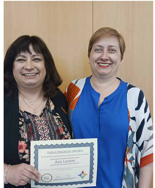
Support Staff & Circulation Services Conference, May 26, 2022