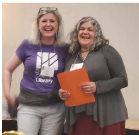
Wisconsin Association of Public Libraries (WAPL) Conference, May 11 - 13, 2022