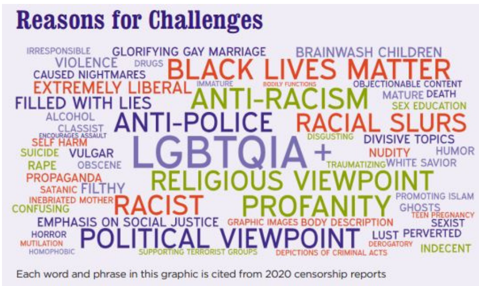
This image is one of many free Banned Books Week downloads available to you! https://www.ala.org/advocacy/bbooks/bannedbooksweek/ideasandresources/freedownloads

"Wisconsin school board member wants to ban Muppets book 'For Every Child, a Better World'"